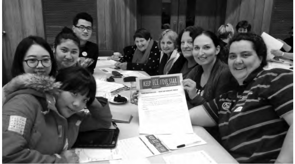
Seminar participants make clear their aspirations for early childhood education.

NZEI members around the country are running ECE networks in their communities. You don't have to be an NZEI member to join in. Let educators in your community know that it's an option. Many networks offer PD as well as peer support. Ring the NZEI helpline 0800 693 443 and ask to speak to the NZEI lead organiser in your area.